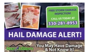
(USPS REP IMAGE)